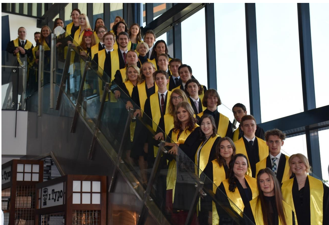
Year 12 Graduating Class of 2019

We were very proud of all Year 12 students for their motivation, hard work and leadership provided within the school. The College also acknowledges our teaching staff who professionally guided and supported our students.